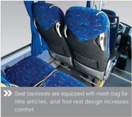
>> Seat backrests are equipped with mesh bag for little articles, and foot rest design increases comfort.