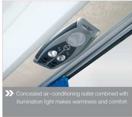
>> Concealed air-conditioning outlet combined with illumination light makes warmth and comfort.