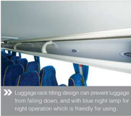
>> Luggage rack tilting design can prevent luggage from falling down, and with blue night lamp for night operation which is friendly for using.