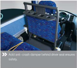
>> Add anti-crash damper behind driver seat ensures safety.