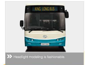
>> Headlight modeling is fashionable.