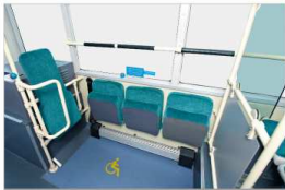
>> Soft backrest, able to secure wheel chair, anti-collision, foldable seats available for passengers when there are no disabled passengers using the area.