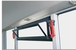
>> Top grade privacy glass is equipped with two in saving side windows in every side, and emergency hammer ready for any type of scenario.