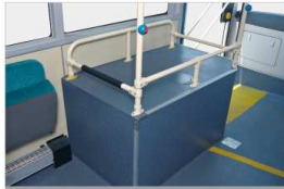
>> Large space of luggage area makes your trip easy. It is also equipped with stop ring, making passengers convenient for getting off.