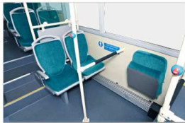
>> Spanish FAINSA seats is fashionable in modeling, comfortable and safe.