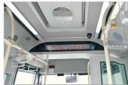
>> LED electric screen with STOP reporting function is matched with interior monitoring camera, and roof escape window.