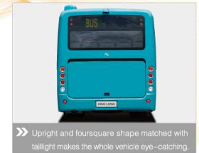
>> Upright and foursquare shape matched with taillight makes the whole vehicle eye-catching.